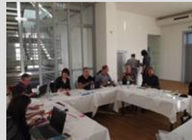
SOS Network meeting in Vienna

On March 26th and March 27th the second meeting of SOS Network took place in Vienna. In this meeting the partners decided the next steps of the working plan. So far, SOS Network has explored the characteristics of the potential target groups going through more than 60 cases in the 12 partner countries that participate in the Network. The final output of this phase, that is about to be delivered by City College Norwich, UK, is a catalogue with descriptions of target groups obtained with the contribution of all partners.